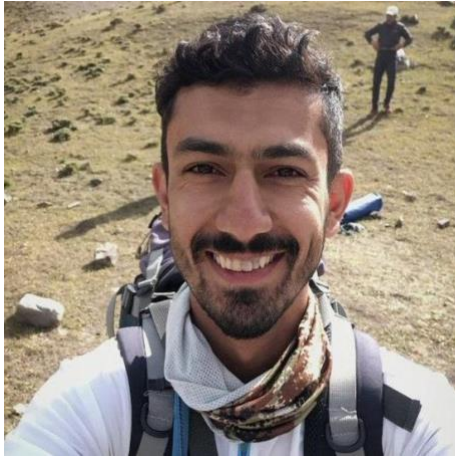
Cycling instructor from Shiraz.