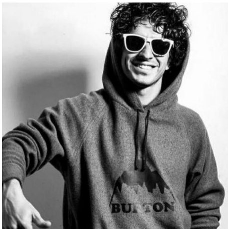
Rock climbing instructor from Shiraz.